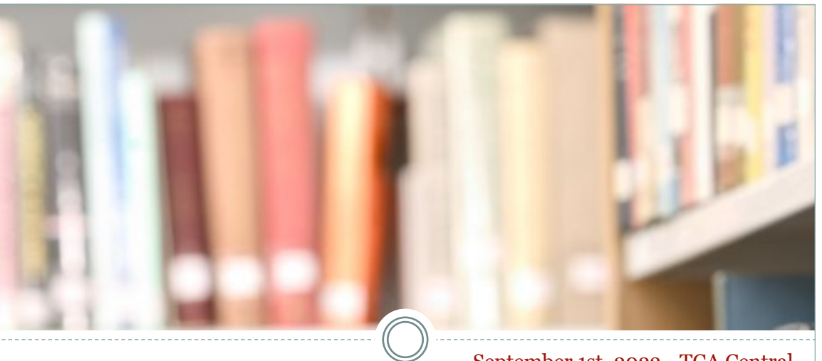
September 1st, 2023– TCA Central

Finding value in building relationships full of positivity, empathy, gratitude and humor.